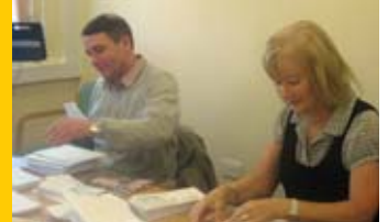
VOLUNTEERS FROM DAIRYCREST HELP WITH LOTTERY MAILSHOT.

The local lady had bought her lucky ticket in the foyer of Fazakerley Hospital whilst visiting a family relative. She went on to say: "I was so thrilled when I heard the news. You never think you are actually going to win. My wedding anniversary is on New Years Eve - so it was a double celebration!" Our fitting winner tells us the money will pay for a 'half-term break' somewhere abroad.