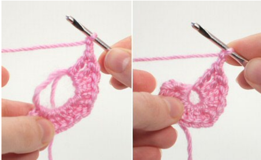
Left: Rnd 1 finished. Right: Magic ring pulled almost closed with a small hole remaining.