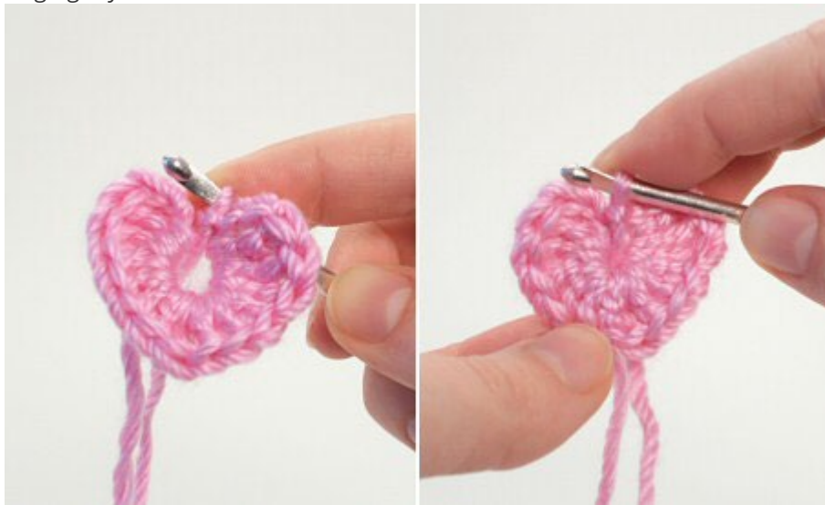
Left: Final sl st made. Right: Magic ring pulled tightly closed.